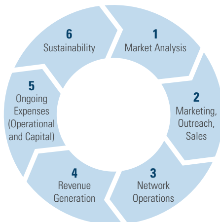
Figure 3. Network Sustainability Cycle

These separate actions should be implemented in the context of the network sustainability cycle, depicted in Figure 3. Customer analysis informs the marketing and sales approach. When the network is activated and begins to generate revenue, management should look at revenue in light of operating expenses and analyze whether the broadband network has sufficient operating capital.