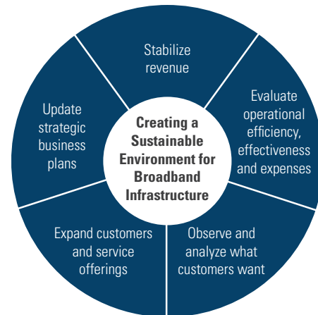
Figure 2. Creating a Sustainable Environment for Broadband Infrastructure